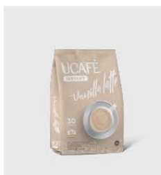
Vanilla Latte - P30