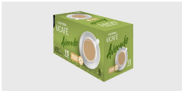
Avocado - B15

Content: 12 boxes Net Weight: 3.6kg Gross Weight: 4.8kg Dimension: 396 x 284 x 221 mm