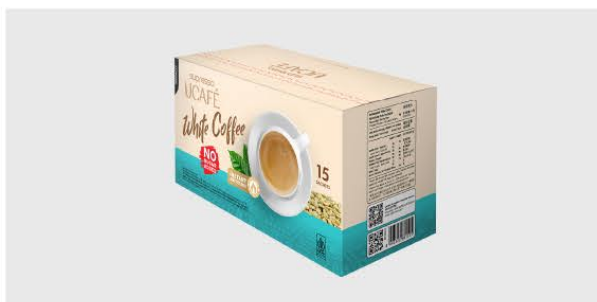
White Coffee - B15

Content: 12 boxes Net Weight: 2.16kg Gross Weight: 3.3kg Dimension: 396 x 284 x 221 mm