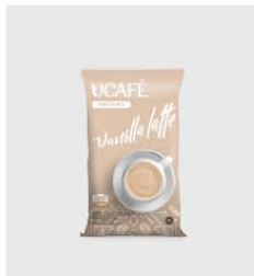
Vanilla Latte - P10