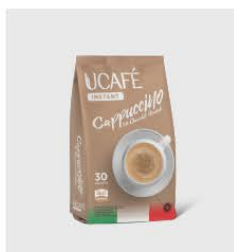
Cappuccino - P30

*Variants: Original, Vanilla Latte, Mochaccino, Hazelnut