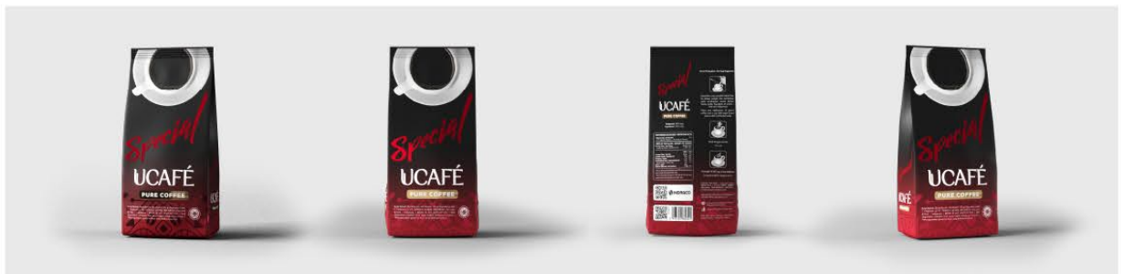
Pure Coffee Special - 150g

Content: 20 bags Net Weight: 3kg Gross Weight: 3.4kg Dimension: 305 x 235 x 180 mm