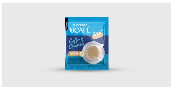
Coffee & Creamer - 12g