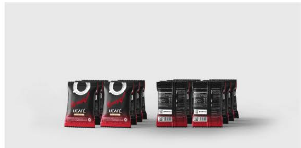
Pure Coffee Special - 7g