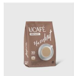
Hazelnut - P30