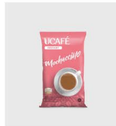
Mochaccino - P10