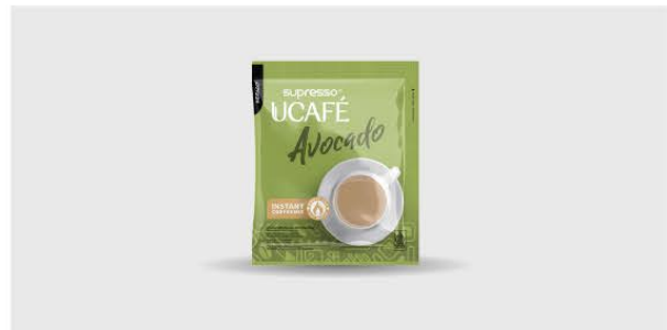
Avocado - 20g