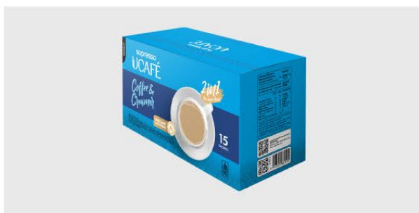
Coffee & Creamer - B15

Content: 12 boxes Net Weight: 2.16kg Gross Weight: 3.3kg Dimension: 396 x 284 x 221 mm