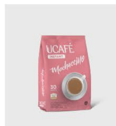
Mochaccino - P30