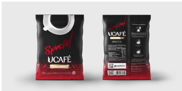
Pure Coffee Special - P20

Content: 10 bags Net Weight: 1.4kg Gross Weight: 1.9kg Dimension: 305 x 235 x 180 mm