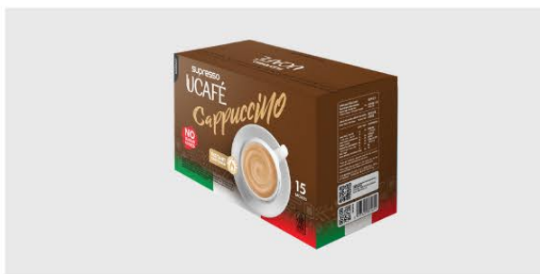
Cappuccino No Sugar Added - B15

Content: 12 boxes Net Weight: 2.16kg Gross Weight: 3.4kg Dimension: 396 x 284 x 254 mm