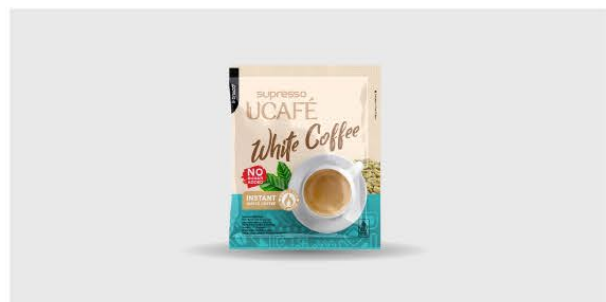
White Coffee - 12g