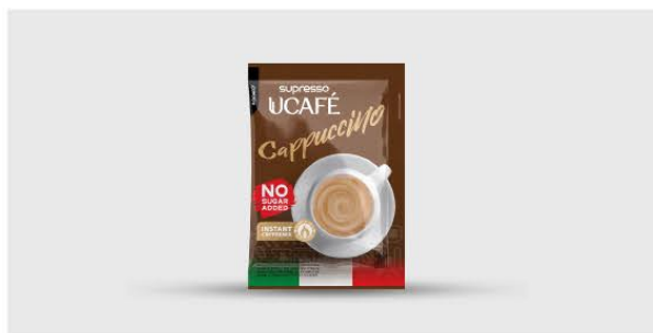
Cappuccino No Sugar Added - 12g