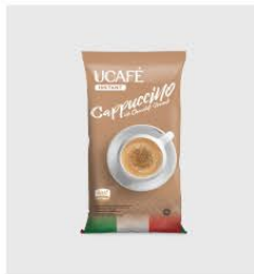
Cappuccino - P10

*Variants: Original, Vanilla Latte, Mochaccino, Hazelnut