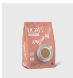
Original - P30